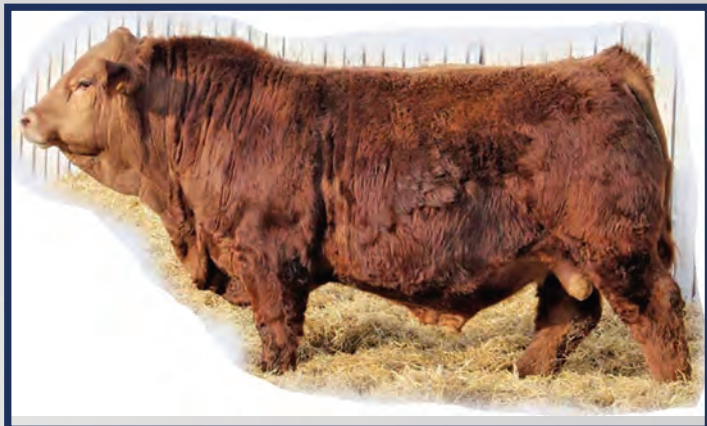
Skors Kill Switch 148G