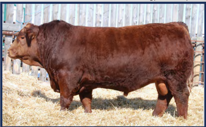
SBSF Eastwood 22E

The Bootlegger 87G bull has really allowed us to raise the bar for the performance of our red Simmental heifers first calves. They are shaped right to come easy without being too small to perform later in life. His grand dam has a great bull calf in the sale this year. The females in Bootlegger 87G's pedigree are so extremely sound. They profile nicely and travel and keep well. 87G is in the top 1% of the breed for calving ease and has impressed us so much with this set of heifers calves he will very likely find his place back in the replacement pen once again come spring.