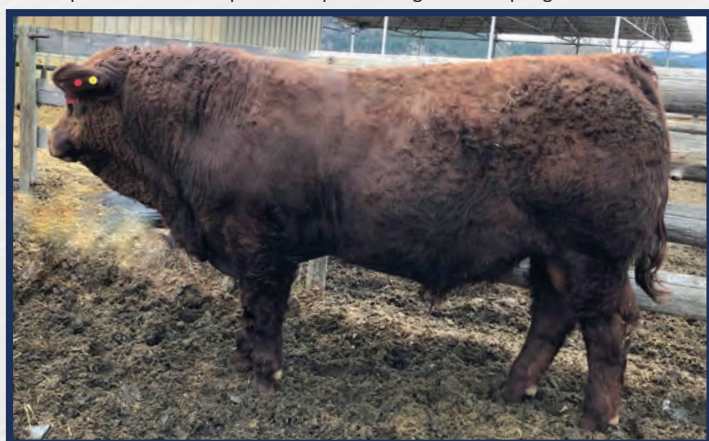
MAVV Galen 48G

This is one of the most moderate and easy to look at sires in the herd bull pen which we purchased for $20,000. I'm sure he hasn't dropped an ounce of flesh since the day he got here, and that's pretty impressive in itself considering his depth and thickness. A very complete package that is eye appealing and to no surprise calved extremely well on heifers with EPD's in the 1st percentile for CE, BW and MCE. Springcreek Simmentals bought a semen package and used him on heifers and mature cows and the resulting progeny are fantastic. His last years sons in the Pursuit of Perfection sale brought as much as $20,000, $18,000 and $16,000. We are calving his second set of heifers now, they are all well balanced, feminine, moderate young brood cows that all set up pretty udders with ample milk.