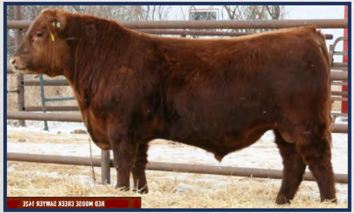
Red Moose Creek Sawyer 142E

Driver 27G is out of a really sweet, soft sided, attractive fronted six-year-old cow with a good udder. She is sound, keeps easy and produces well. 27G is a true calving ease bull, and his EPDs point to that as well. He had a 64-pound birthweight but ranked in the top of his group for weaning weight. His calves have proven to be shaped right to come easy and he will likely find his place in the heifer pen this spring.