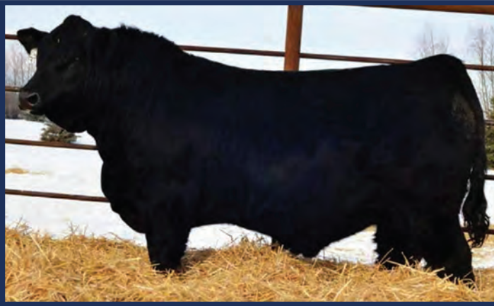
Erixon State of War 207F

State of War 207F was the high selling black Simmental bull in Erixon Simmentals 2020 sale. We purchased him based on his phenomenal calving ease traits, curve bending growth and foot quality. I can't say that I ever remember having a herd sire whose calves consistently came with nearly a week early gestation. Never mind how much explosive growth they have after birth. The replacements in the pen certainly do not look like heifers first calves and we feel that the bulls on offer this year fit in perfectly as well. It makes a huge difference to your calf crop when you can count on first calvers to raise calves that fit right in with the rest.