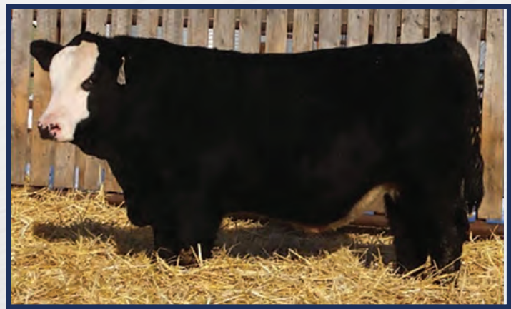
PRL Gringo 66G

Progeny of the Captain Morgan 195G herd sire have been very consistent. They are stout, heavy haired, very attractive fronted, strong topped and possess an eye appealing muscle pattern. For a bull that is so stout he calves very well, we would breed him to our more mature heifers comfortably. Circle G Simmentals purchased his dam, the second high selling red cow, from Skor Simmentals dispersal for $13,000. 195G's second calf crop is on the ground now and they are just as exciting as the last. We really look forward to calving his daughters next year.