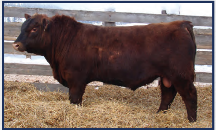
Red Mitchell's Park 79G

The "Utah" herd sire was chosen for his excellent curve-bender performance. He was born at just 62 pounds and yet his two-year-old dam had him weighing 800 pounds come weaning. His heifer calves in the pen are some of the heaviest Angus as well, even off of first calf heifers. We retained a son for our own use last year and we are so impressed with the quality of his calves. Utah has been an absolute dream for calving ease. He is king of the heifer pen but saw a lot of cows as well. It is a no brainer when calves come consistently lighter and grow so well.