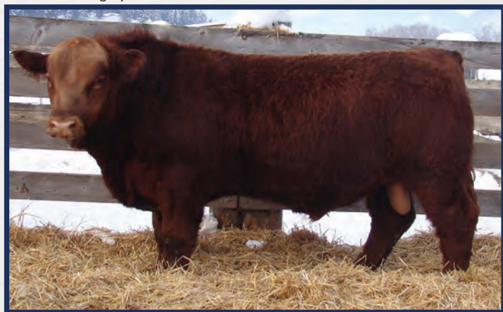
Mitchells Bootlegger 87G

Kill Switch 148G was selected out of Skor Simmentals final bull sale following their dispersal and was the second high seller at $17,000. He is a big barrelled, moderate framed herd sire with good muscle expression. This spring he remains in good shape – he's still a tank. His calves have proven to be growthy and soft middled and yet they come easy with very moderate birthweights, just as his impressive set of EPDs predicted. We have retained a son for our own use that we are extremely excited about and both him and his sire will see some cows in breeding pastures this year.