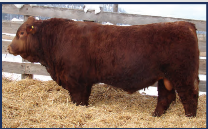
Mitchells Venom 34G

One of my favourite herd sires in the mature bull pen. He has kept well, is a very good breeder, and passes along his massive hip, muscle expression and dark red, heavy hair to his progeny. Galen 48G is so impressive that one might take a second guess at his calving ease, but it is phenomenal as well, he is in the top 20% for the calving ease EPD. He is better than average for birthweight, top 10% for weaning weight and carcass weight, and top 15% for yearling weight EPDs. We will be putting him with as many cows as a pasture can handle this spring, and look forward to adding more of his offspring to the herd.