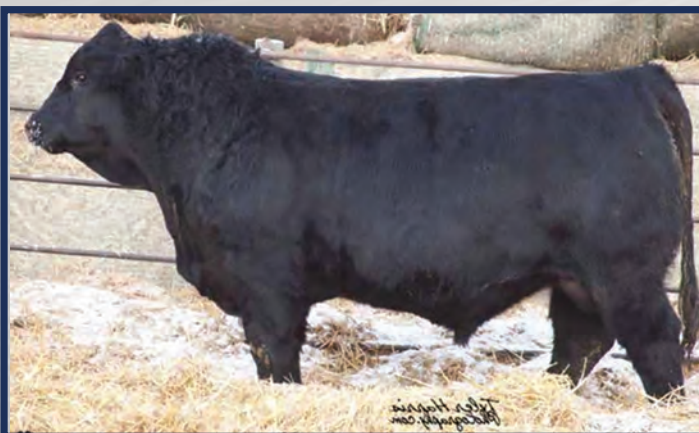
Muirhead's Time Out 263B

Gringo 66G is an extremely smooth individual with so much substance. His calves' birthweights were moderate and came easy, as his top 10% calving ease and birthweight EPDs suggested. Coming from the Porters program this bull has built-in carcass merit and accuracy, ranks in the top 5% for marbling and the top 10 and 15% for carcass weight and ribeye area. His growth EPDs are also well above average. There isn't much you can fault this herd sire on and we feel that his first calf crop is a great testament to his quality.