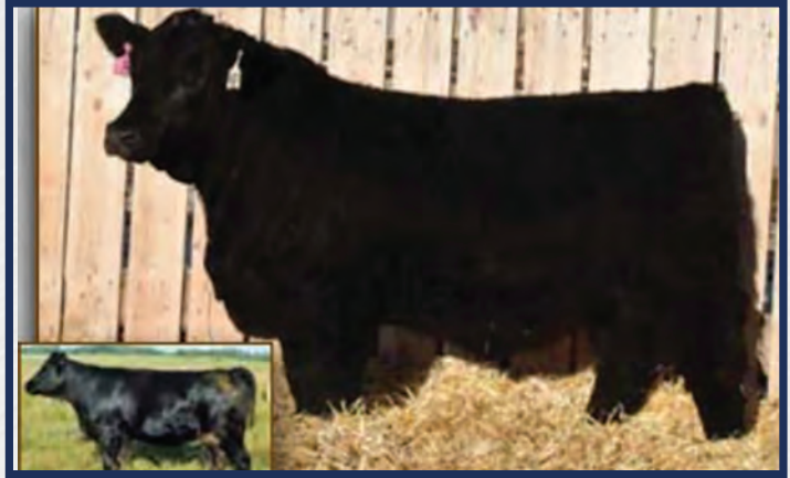
Circle G Explorer 40E

State of War 207F was the high selling black Simmental bull in Erixon Simmentals 2020 sale. We purchased him based on his phenomenal calving ease traits, curve bending growth and foot quality. I can't say that I ever remember having a herd sire whose calves consistently came with nearly a week early gestation. Never mind how much explosive growth they have after birth. The replacements in the pen certainly do not look like heifers first calves and we feel that the bulls on offer this year fit in perfectly as well. It makes a huge difference to your calf crop when you can count on first calvers to raise calves that fit right in with the rest.