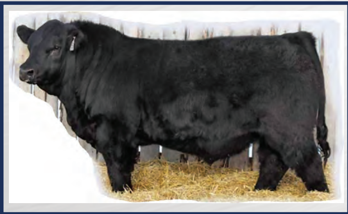
Skors Capitan Morgan 195G

A bull purchased based on his performance blended with great CE, BW and MCE numbers and his dam's quality and productivity. We have been very pleased with 40E's calves. They are thick made, well muscled and some of the heaviest steers come fall were sired by "Explorer." The udder quality and milk production of his females we have calved is absolutely ideal. We are very pleased with their phenotype and feel that they will mature to be a backbone in the Black Simmental division.