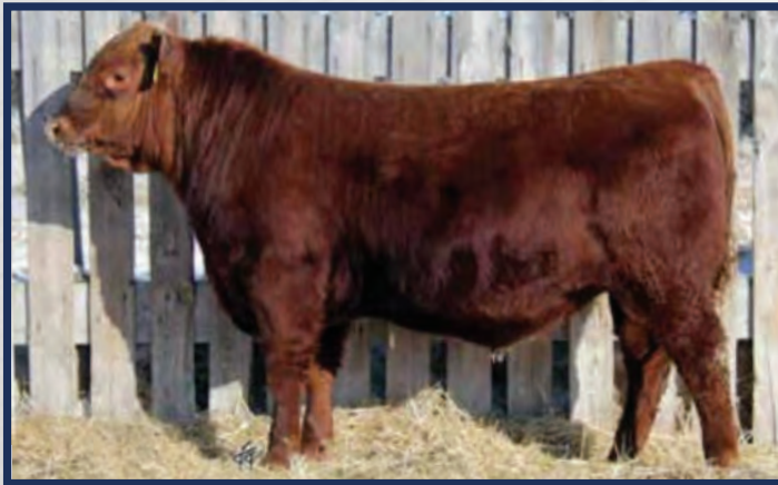
RED RSL UTAH 835F

The "Utah" herd sire was chosen for his excellent curve-bender performance. He was born at just 62 pounds and yet his two-year-old dam had him weighing 800 pounds come weaning. His heifer calves in the pen are some of the heaviest Angus as well, even off of first calf heifers. We retained a son for our own use last year and we are so impressed with the quality of his calves. Utah has been an absolute dream for calving ease. He is king of the heifer pen but saw a lot of cows as well. It is a no brainer when calves come consistently lighter and grow so well.